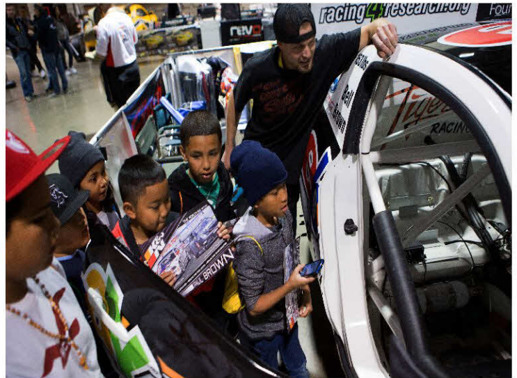
ELEMENTARY SCHOOL STUDENTS ON FIELD TRIP CHECK OUT JUSTIN BELL'S RACE CAR AT THE 2012 TOYOTA GRAND PRIX OF LONG BEACH.

www.justinbell.com , www.oncars.com , www.Racing4Research.org , www.pirelli.com , www.world-challenge.com , www.scca.com