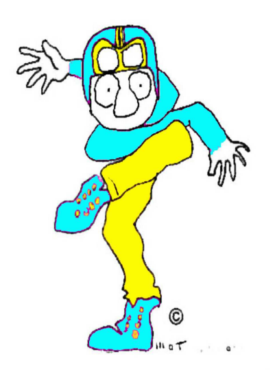
BE FLEXIBLE WITH DREAMS AND GOALS!